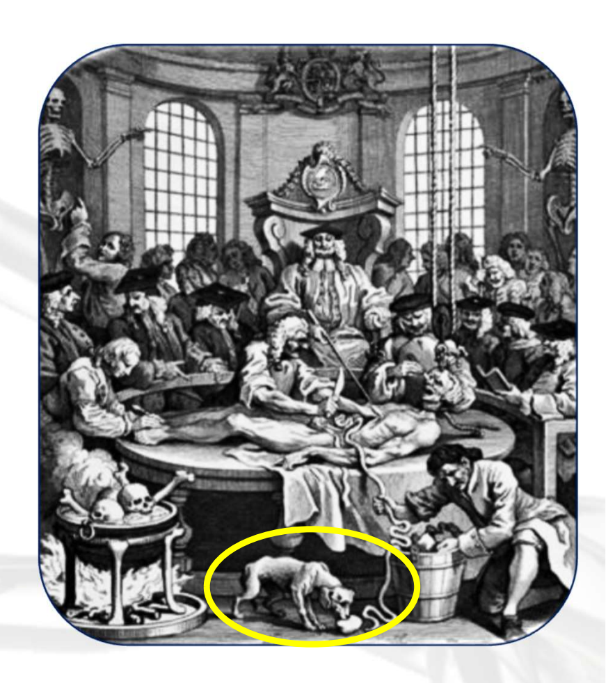
The Reward of Cruelty