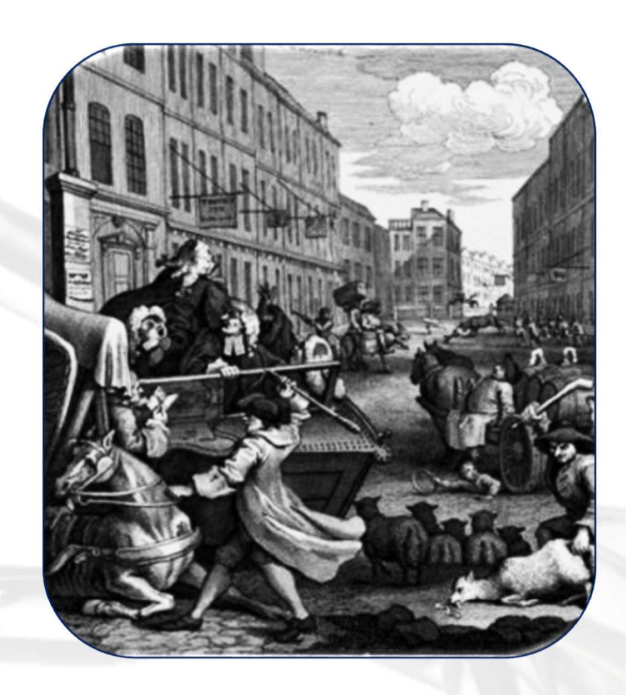
The Second Stage of Cruelty