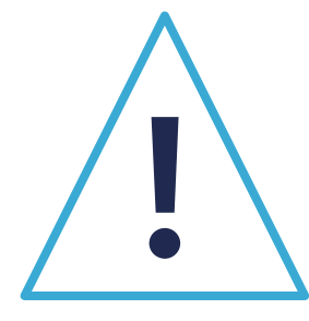
This could impact on the admissibility of the evidence provided by your organisation.